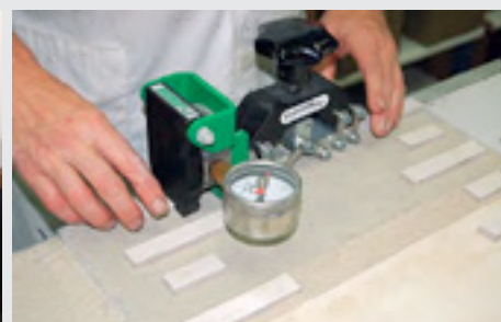
C) Shear test by means of proper instrumentation (Pressure meter - shearing hydraulic meter)

WARNING: This technical data sheet is not a valid specification and, if it consist of multiple pages, be sure to read the full document. This instruction are the best of our current experience but are indicative information. Assuming the liability resulting from the use of this product, it is up to the user to establish whether the product is suitable for the intended use.