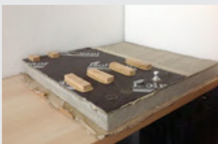
B) Samples for shear test on glued wooden flooring and samples for pull-up test ("test dolly")